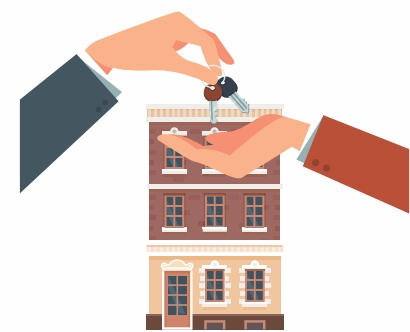
A New Building

Why live in an uneconomical, dilapidated building when you can transform it into a modern home with latest amenities? Redevelopment with ISCON Group does just that. It takes your aging house, rebuilds it and gives you back a home decked with functional amenities you never thought you would have.