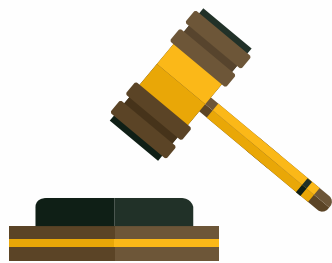
An Established Name in the industry