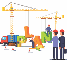
Has a Strong Team of engineers and architects to offer Seamless Solutions