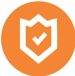
A Trusted and Reliable Brand

Why us, you may ask. Your home is your most important asset. When you consider handing it over to a developer for redevelopment, you need to be doubly sure that it's in good hands. With a glorious legacy of over 25 years and proven expertise in building landmarks, ISCON Group is your perfect partner in restoring your home. With us, a totally hassle-free redevelopment experience is guaranteed!