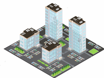
Well Planned apartments with Parking