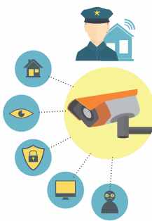
Safety & Security

All this along with the happiness of not having to leave your home and your own neighborhood!