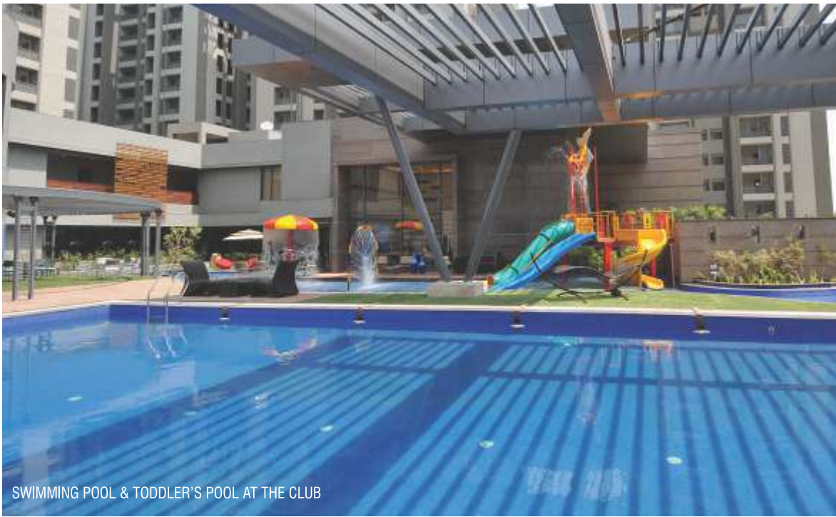
SWIMMING POOL & TODDLER'S POOL AT THE CLUB