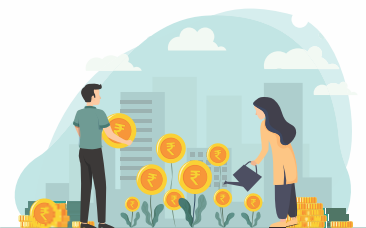
Substantial Increase in flat's Value