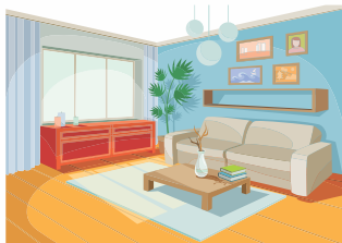
Wider Space & Extra Carpet Area