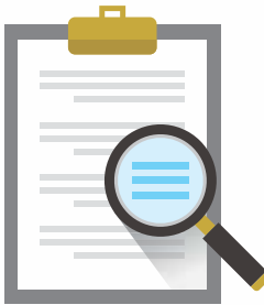
Adheres to Total Transparency & Ethical Practices