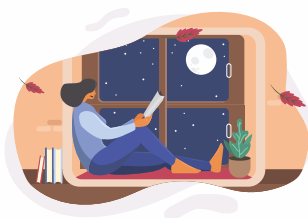
Believes in the Comfort of the Residents