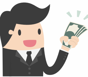
Offers you Highest Value for Money