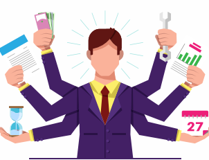
Excellent Project Management Skills and a Professional Functioning ensures Timely Delivery